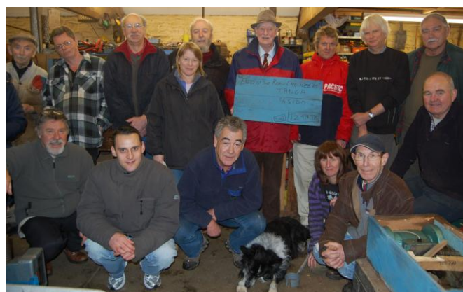
Enjoying what we do . . . at our Christmas Do

There are a number of Objectives arising from the above goals and these will inform our Action Plan. To illustrate this, Goal (f) has the following objectives: