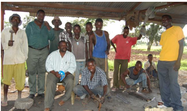
Ikukwa A: one of the groups to receive tools and training

In the container that we sent to Tanzania in April, there were 44 refurbished tool kits including 160 sewing machines; all for Tanga and Singida regions. There were also 10,600 carefully chosen and sorted tools ready for refurbishing by Saidi Maguta and his team in the SIDO*/TFSR Cymru workshop in Mwanza.