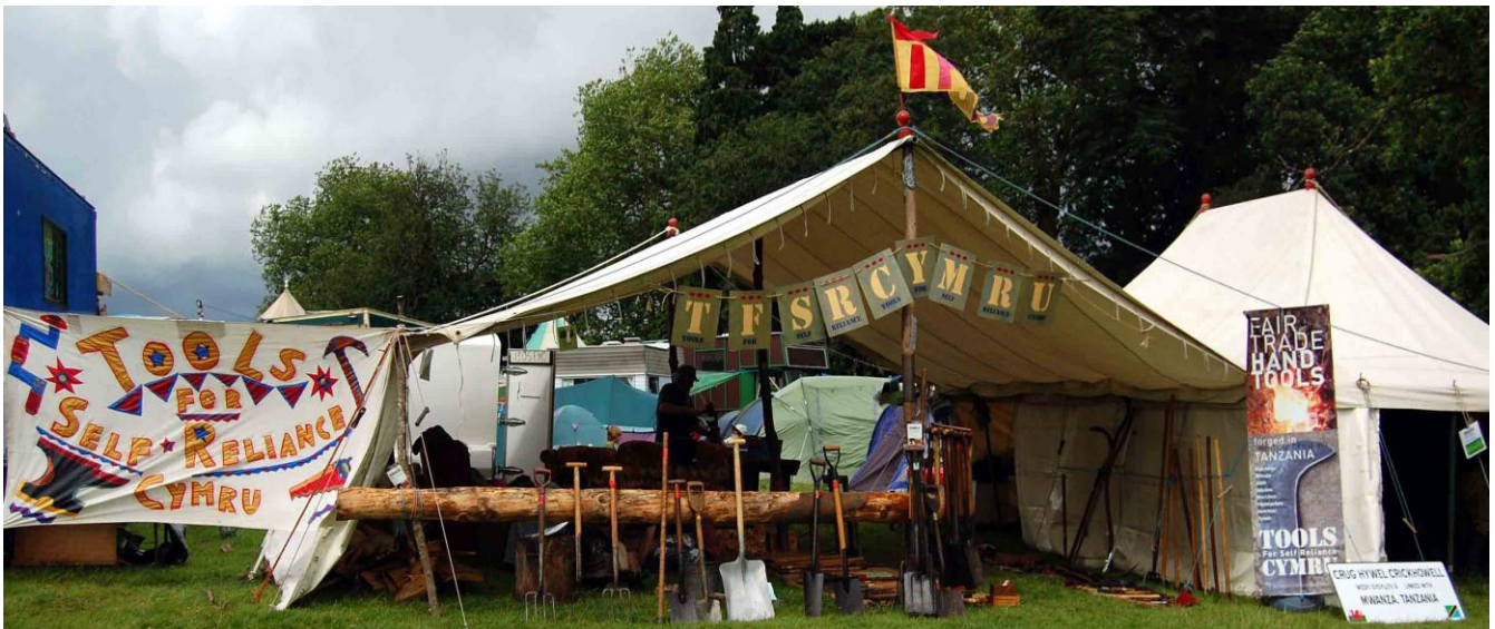
Our stall at the Green Gathering where we sold plenty of tools to pay for our overseas work

This is the simple idea behind our work: recycling hand tools, many of which might otherwise have ended up in landfill sites, and redistributing them to people in developing areas of the world who can use them to build a better life for themselves, their families and their communities.