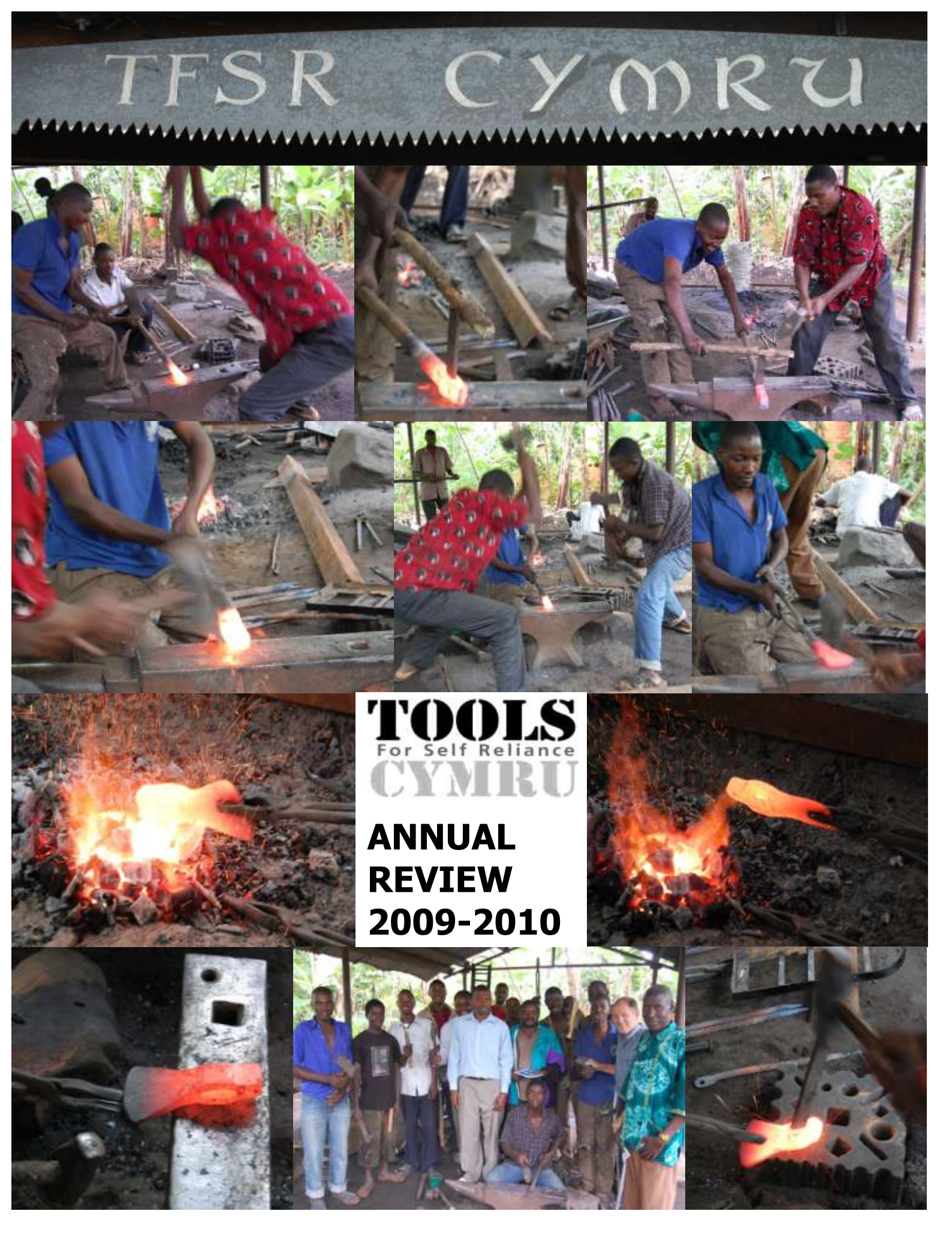
Forging a side axe from a lorry half-shaft - ITAHWA BLACKSMITHS